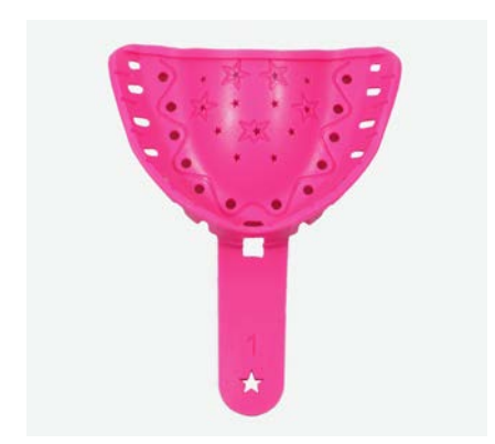
Impression Tray Small Upper IT02SMU-1

Non-Sterile. 25 trays per box | 4 boxes per carton