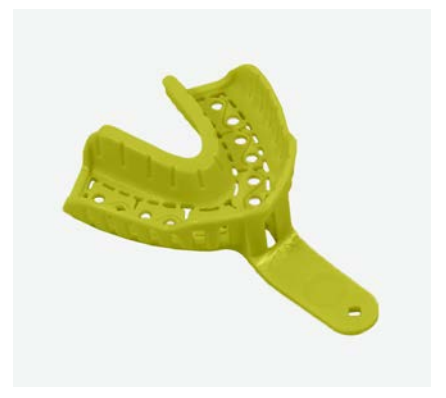
Impression Tray Medium Lower IT03MDL-1