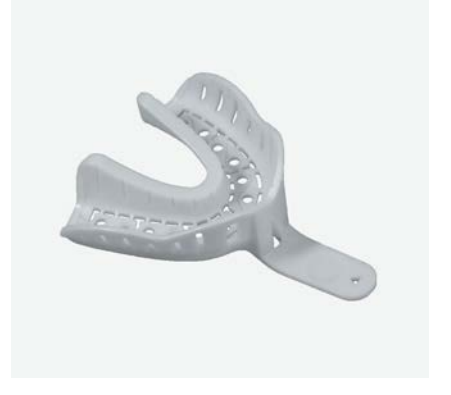
\begin{array}{c} \text{Impression Tray Extra Large Lower} \\ \text{IT}07\text{XLL-1} \end{array}