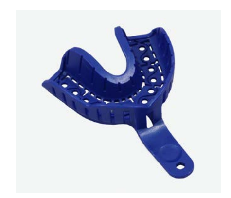
Impression Tray Large Lower IT05LGL-1