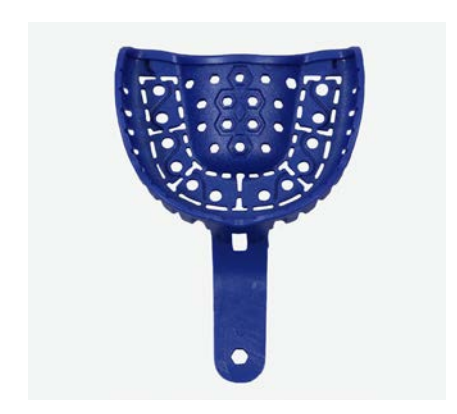
Impression Tray Large Upper IT06I GU-1