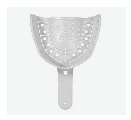
Impression Tray Extra Large Upper IT08XI U-1