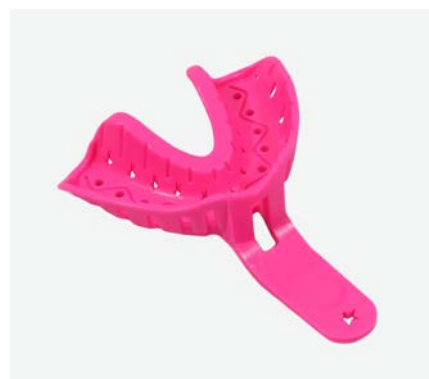
Impression Tray Small Lower IT01SML-1